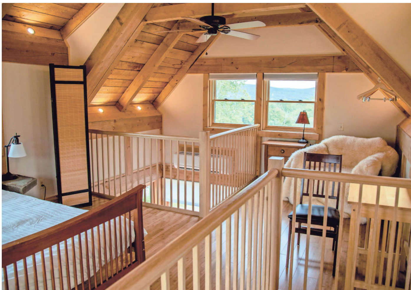
The upstairs bedroom of a modular tiny house built by Tiny Timbers LLC, of Ithaca.