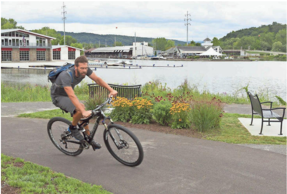
A cyclist makes his way along Phase II of the Cayuga Waterfront Trail, next to the state DOT base that overlooks the Cornell University rowing center, left, on the Cayuga Inlet.