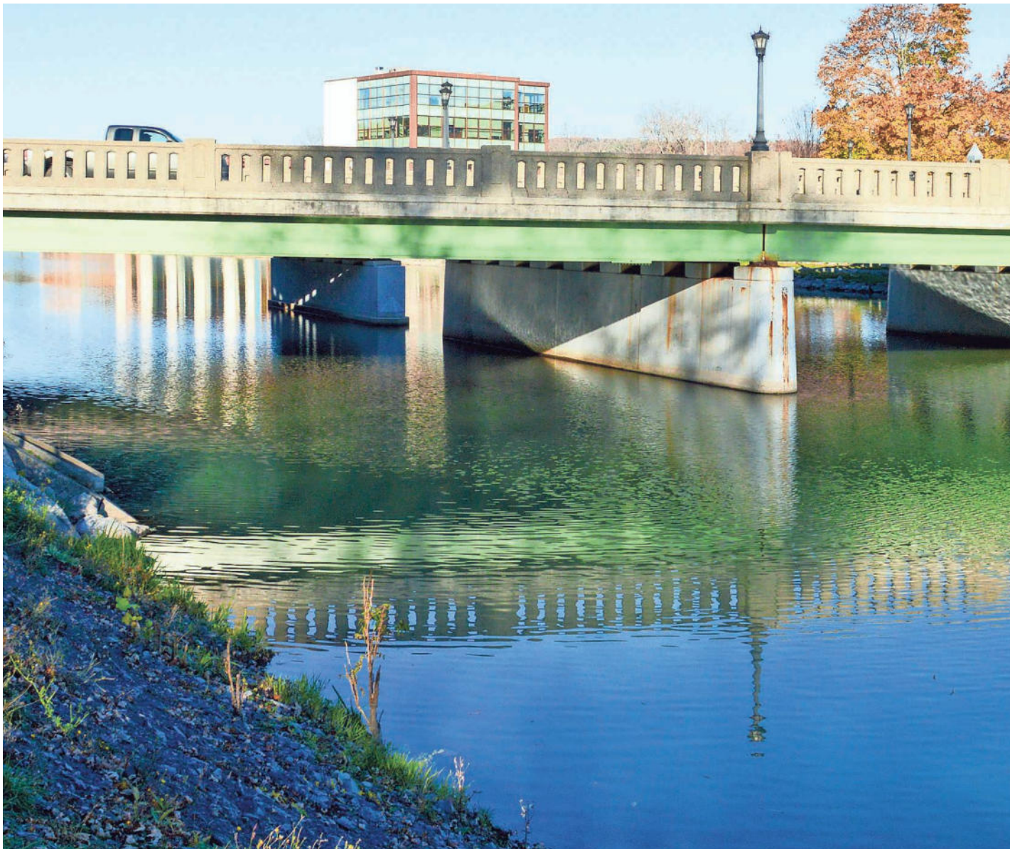
The Cayuga Inlet, as viewed from the bike path of the Black Diamond Trail. Up to one million gallons of sewage could have flowed into its waters last month.

Up to 1 million gallons of raw waste may have leaked into Cayuga Inlet