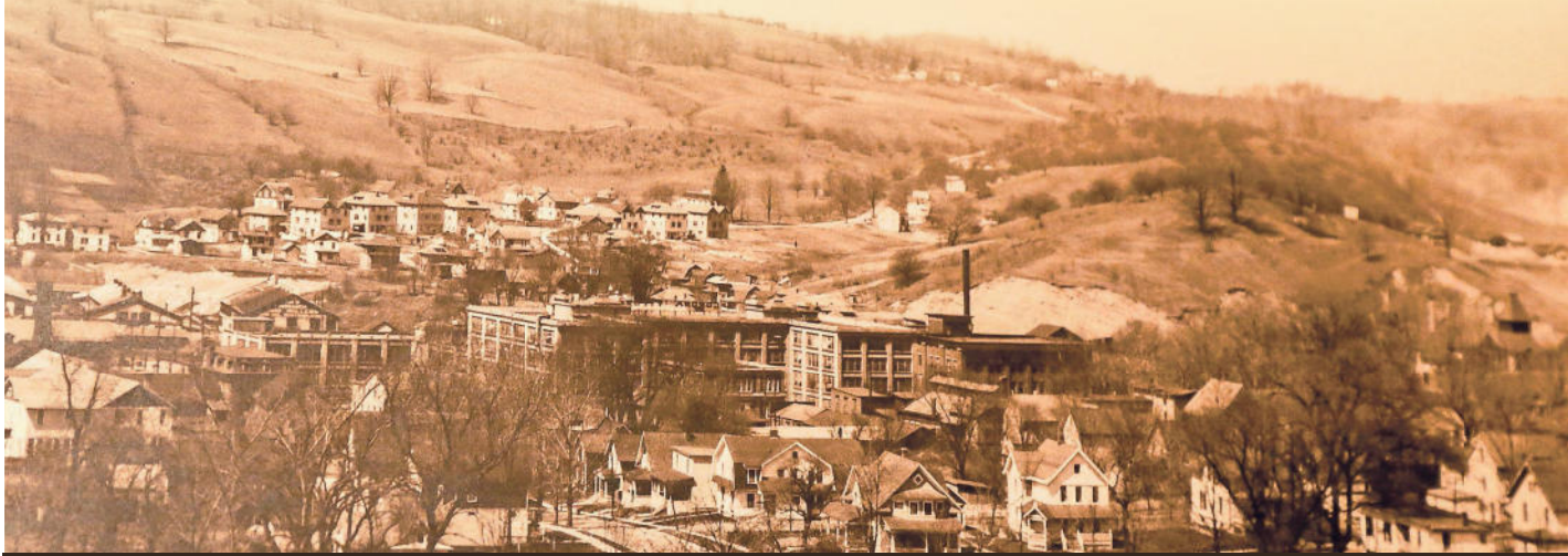
A view overlooking the Corona Typewriter Factory in this undated photo. Beyond the factory on the opposite hill is a row of boarding houses constructed by the company to house workers. Top, workers at the Corona Typewriter Factory in an undated photo.

The roots of a great writer can always be traced back to some point. When reflecting on the origins of a literary giant like, say, Ernest Hemingway, the lines can be traced back to numerous starting points. • One could argue the seed was planted in the newsroom of the Kansas City Star, pounding out copy on rickety keys with an editor on his back or even in Toronto, refining his craft in a different setting. Maybe it could have been while at war, serving as an ambulance driver in Italy, where he found the prose that would make him a legend. See CORONA , Page 4A